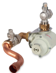
Cyclone Filter Part Number: 3.024172