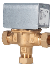
Three-Way Diverter Valve Kit Part Number: 6.5500048