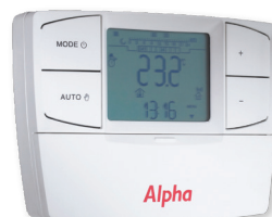
Comfort 2-Channel Control Part Number: 3.022142